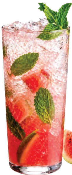
Watermelon Mojito £5.49

A twist on the classic Mojito infused with sweet watermelon and a splash of sparkling water served over crushed ice.