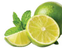
Party on the Beach £5.49

A classic mix of peaches with cranberry and orange juice over crushed ice.